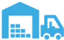
TABLE TALKS MONTHLY COLLABORATIVE DISCUSSION ACROSS 10+ PANTRIES

Warehouse operation helps facilitate food pickup and distribution for the small Neighborhood pantry = possibly allowing them to be open more often